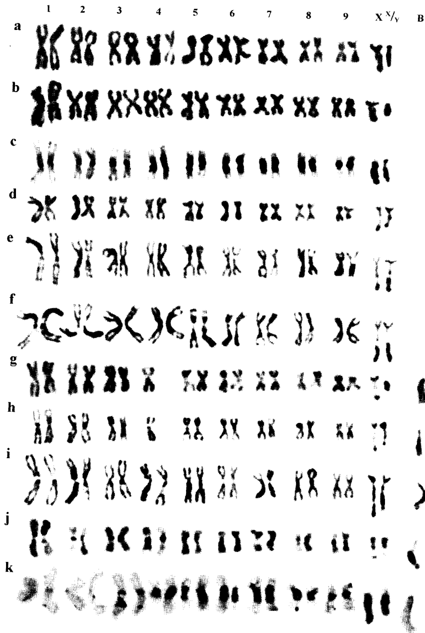
Fig. 3: Mitotic chromosomes of Aphodius sphacelatus ; a, b: ♂, mid-gut, Old Windsor, from the same specimen; c: ♂, mid-gut, Netherlands, C-banded; d – f: ♀, mid-gut, Old Windsor, three preparations from the same specimen; g: ♂, mid-gut, Old Windsor, with one B-chromosome; h: ♀, mid-gut, Old Windsor, with one replicate of autosome 4 missing, and one B-chromosome; i: ♀, mid-gut, Old Windsor, with one B-chromosome; j, k: ♀, mid-gut, Old Windsor, with one B-chromosome, j weakly C-banded, k strongly C-banded, from the same specimen.