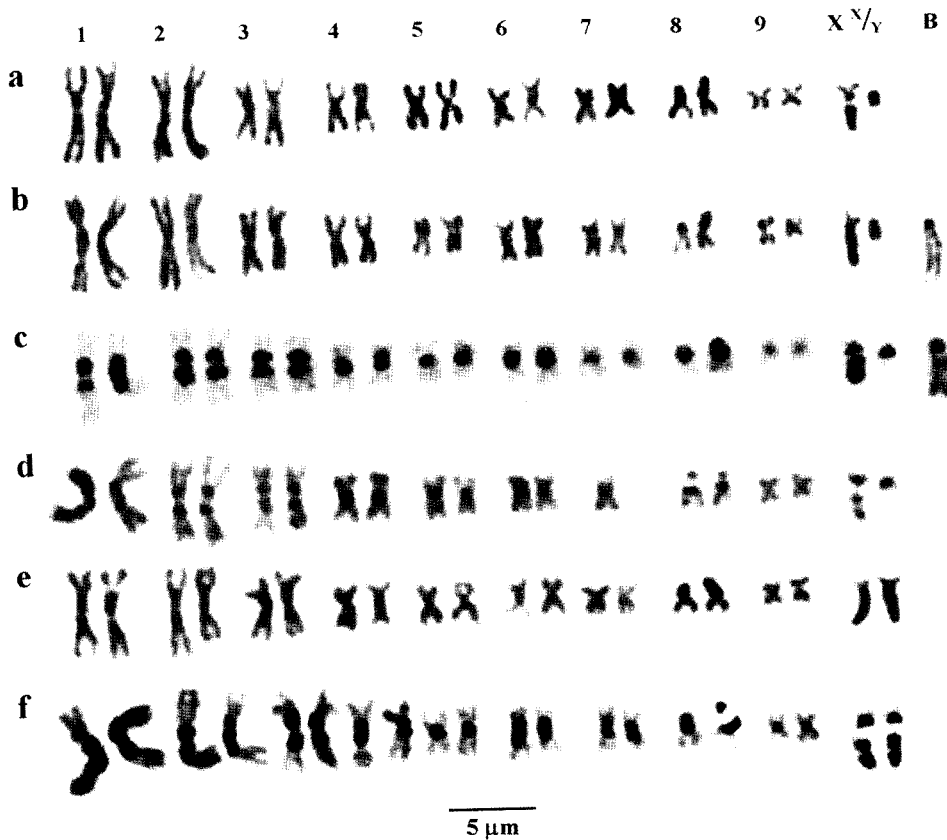
Fig. 2: Mitotic chromosomes of Aphodius prodromus ; a: ♂, mid-gut, New Forest; b, c: ♂, mid-gut, Bookham, B-chromosome present, b plain, c C-banded, from the same specimen; d: ♂, mid-gut, Old Windsor, one replicate of autosome 7 missing, both replicates of autosome 8 with the apical dark section; e, f: ♀, mid-gut, Bookham, e plain, f C-banded, from the same specimen.