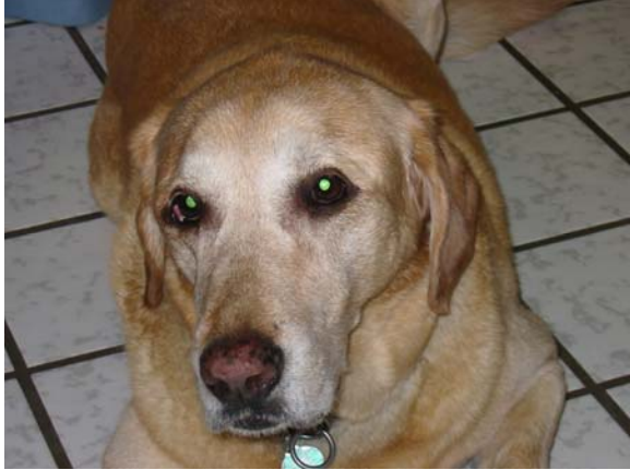
Vince mugs for the camera at a Phi Sigma Tau soirée