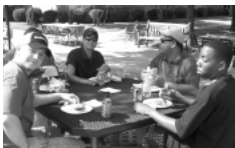
SSW Students enjoy outdoor barbecue