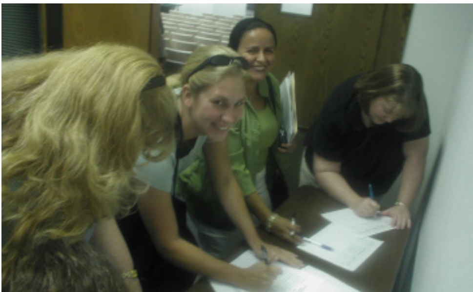
SSW students sign-up to volunteer for hurricane relief efforts