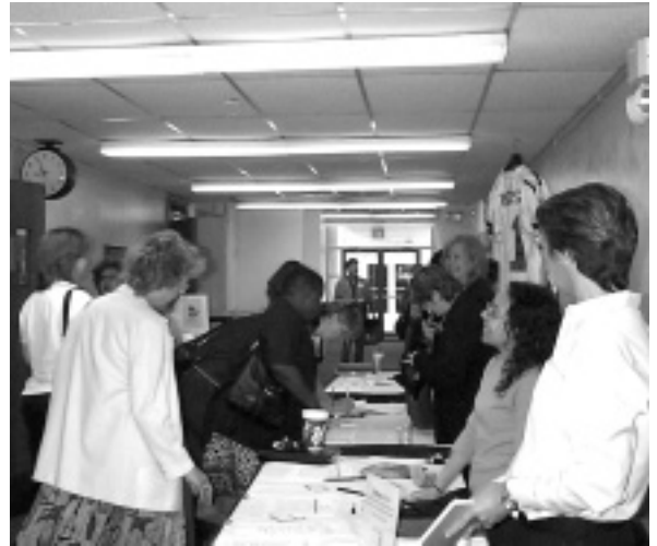
Checking in and networking