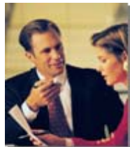
Intermediary/ Advisor Clients